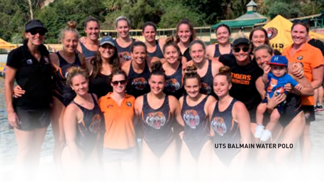
UTS BALMAIN WATER POLO